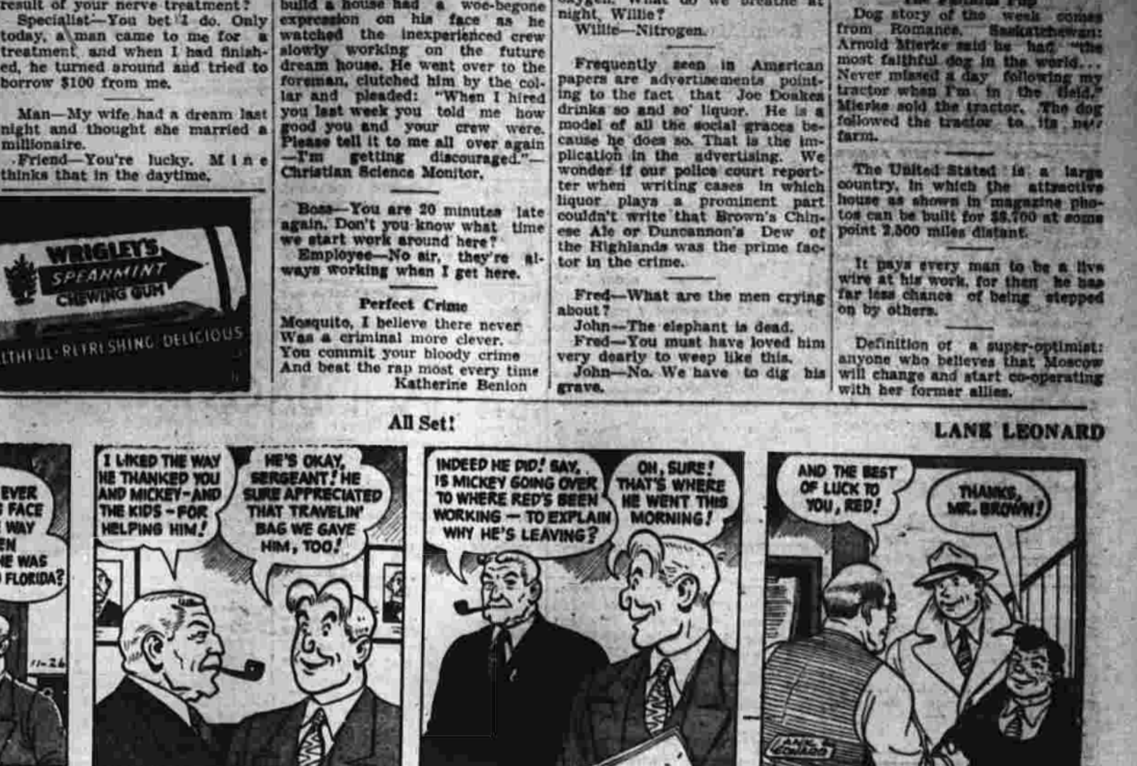
Call—Do you guarantee the result of your nerve treatment? ...