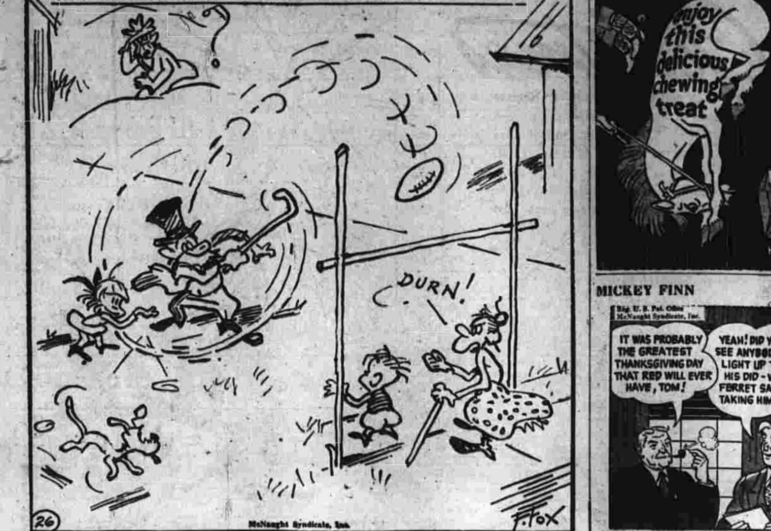
That Midmorning Game Back of the House—Owing to Rheumatism, Grandpa is Allowed to Use His Cane in Trying for Point After Touchdown.