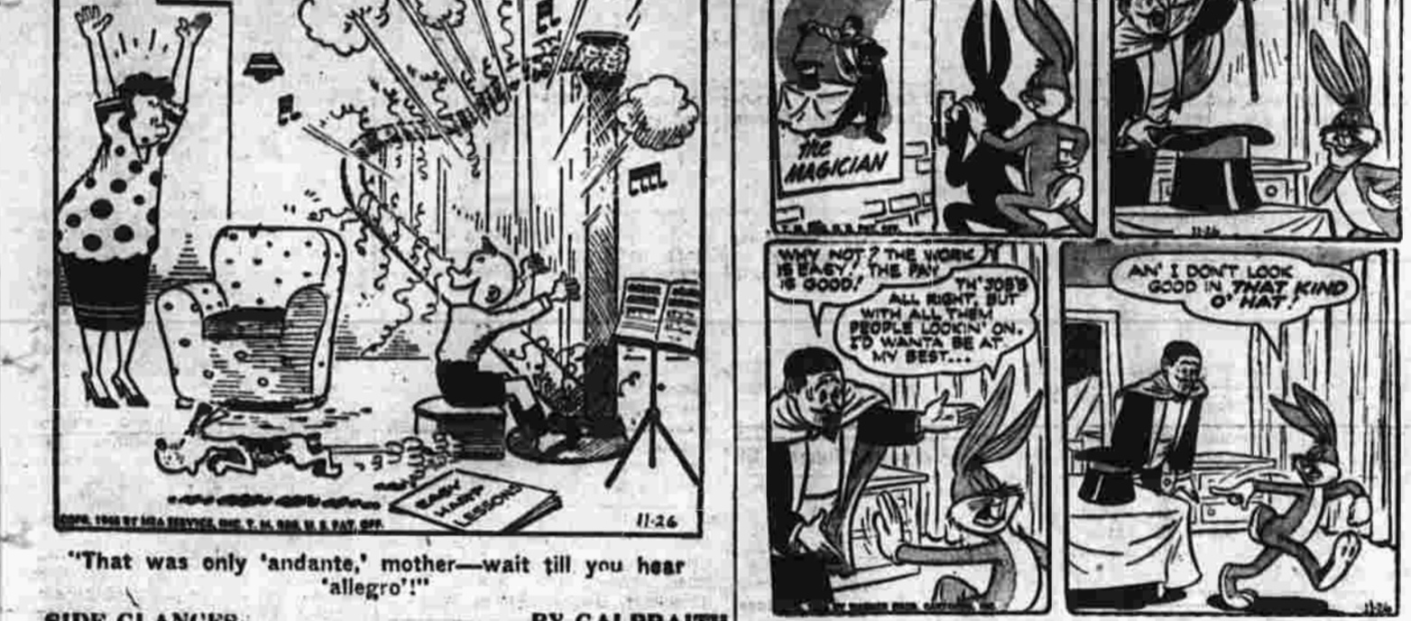
'That was only 'landante,' mother—wait till you hear 'allegro!'