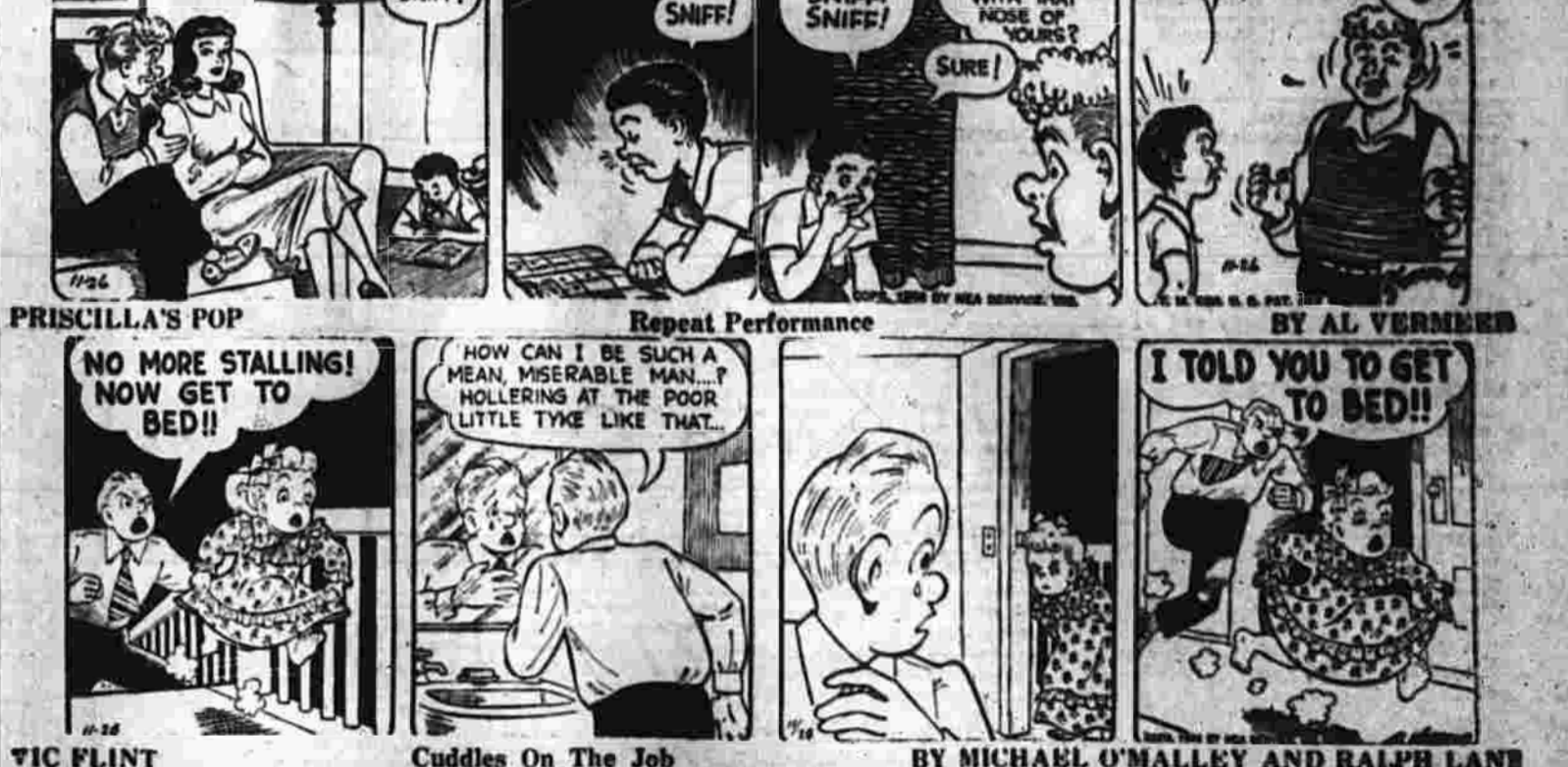
Wanted—Real Estate 77