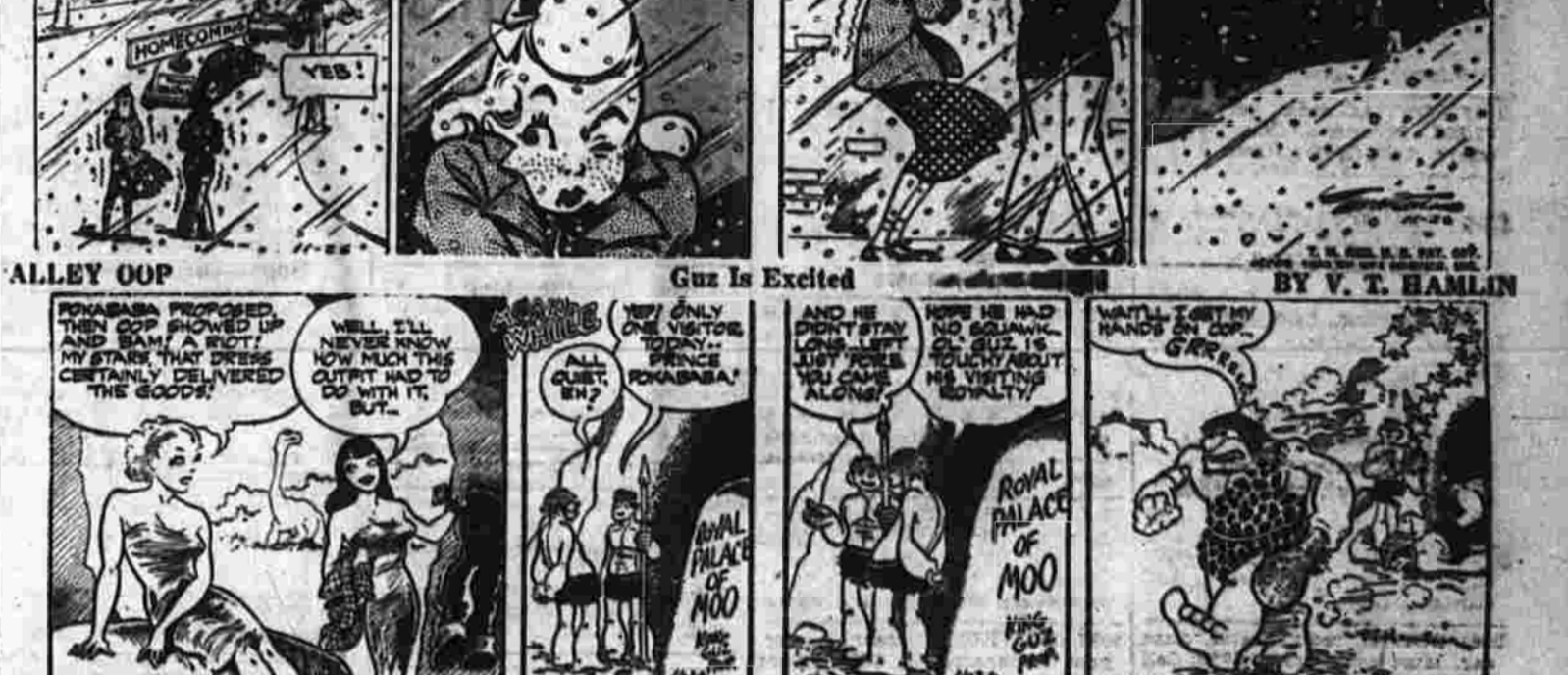
What A Deal